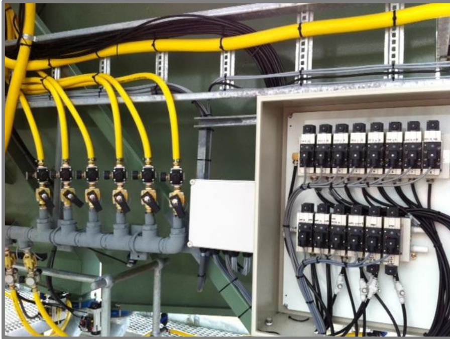
Fully integrated pneumatic system design and installation