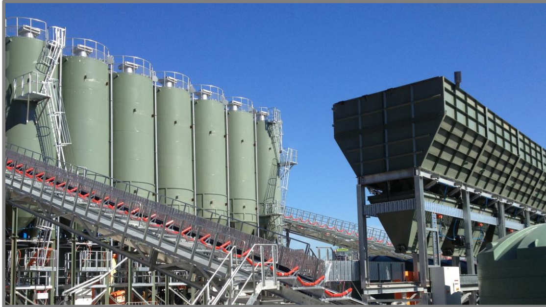
Full plant design, manufacture and installation including CAD drawings for council submissions - company proposals