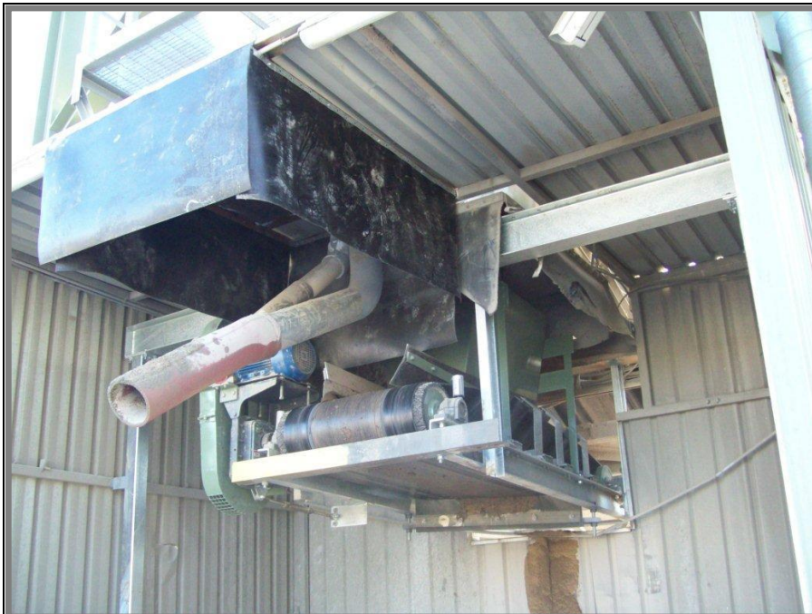
Speed belt system designed and manufactured to convert an existing plant from a “job hopper” style.