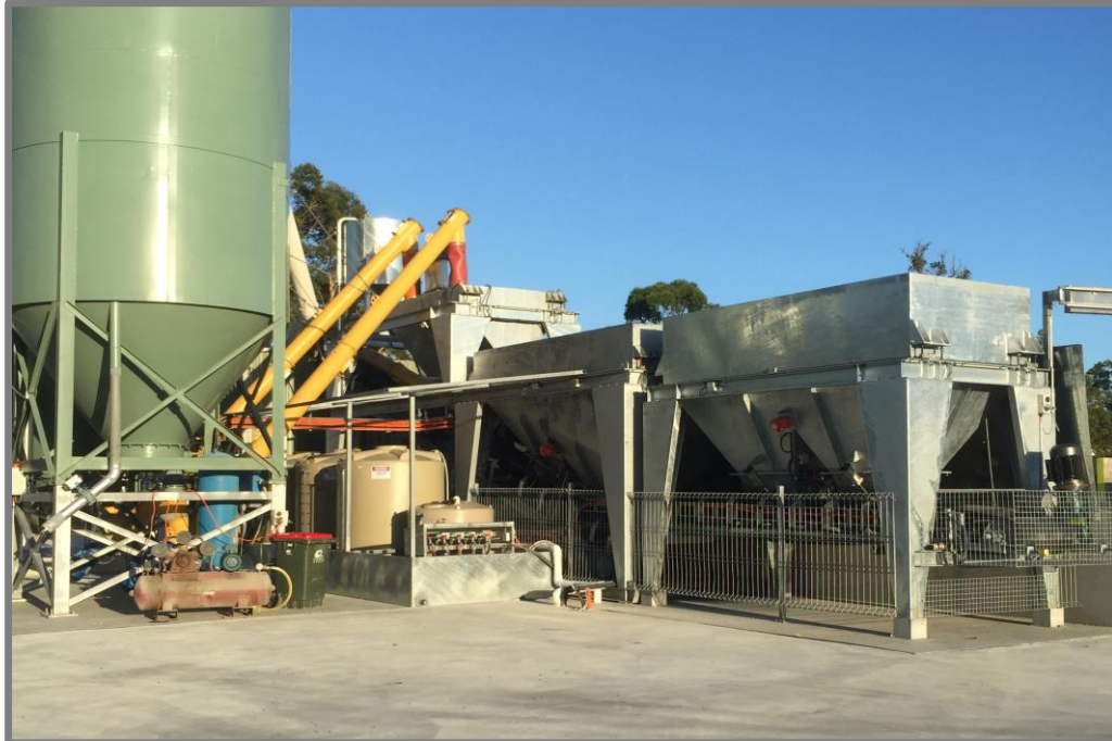
Fully galvanized aggregate weigh bins and conveyor systems