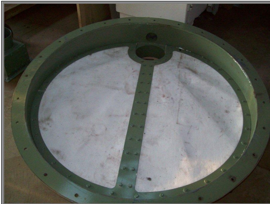
Design and manufacture of specialized aeration pan & air slide systems to suit existing and new silos