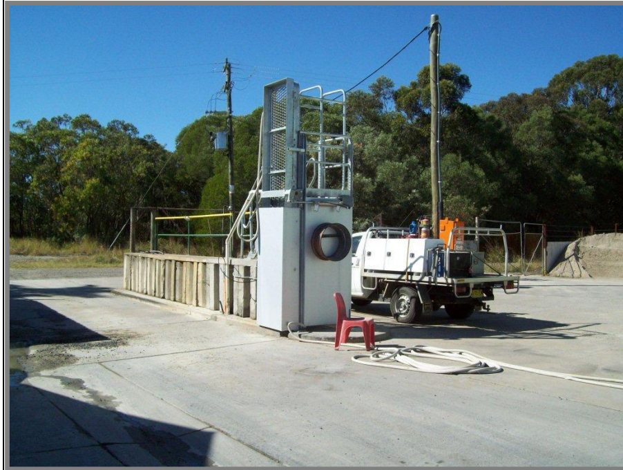
Design and manufacture of fully galvanized fixed or air operated slump stands (single or double)