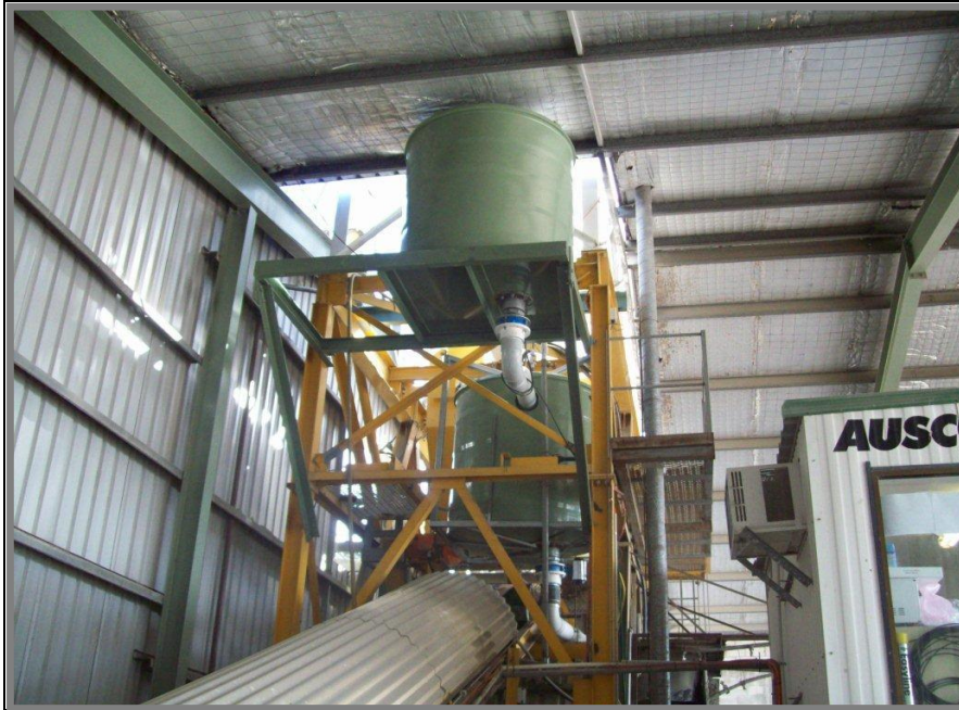
Water weigh hopper system designed and manufactured to suit existing plant upgrade.